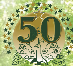
BROWSEA OPEN AIR THEATRE 50TH YEAR CELEBRATIONS IN 2013