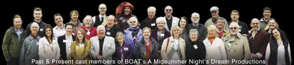
Past & Present cast members of BOAT's A Midsummer Night's Dream Productions

Whilst deeply involved in A Midsummer Night's Dream, she is also editing the script for next summer's production on Brownsea – Henry IV (Parts 1 & 2). The task of converting two plays into one is quite a challenge but she is certain 2014 audiences will enjoy an exciting and humorous production.