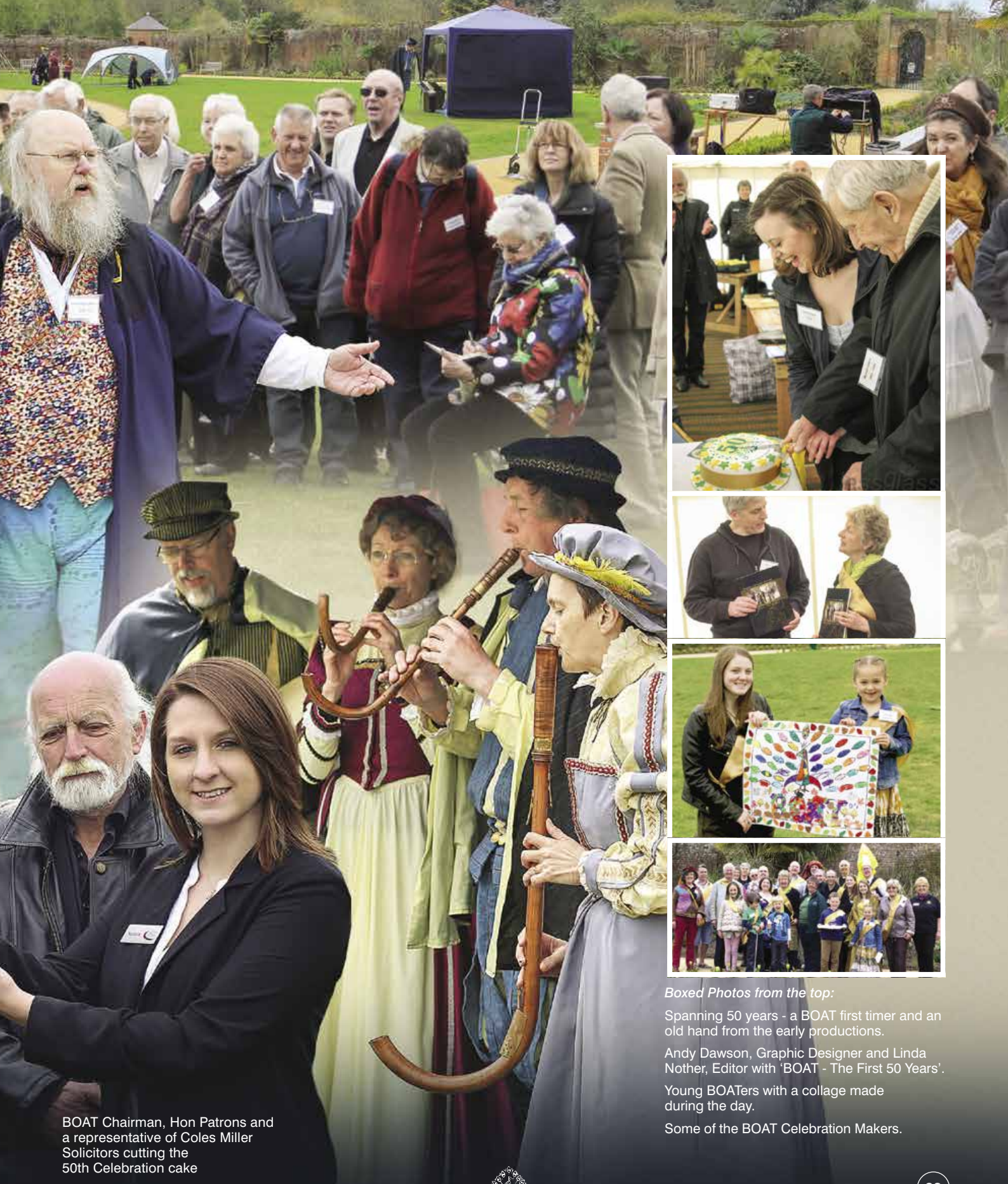
BOAT Chairman, Hon Patrons and a representative of Coles Miller Solicitors cutting the 50th Celebration cake